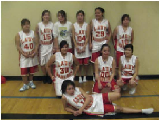
THE NCN LADY WARRIORS