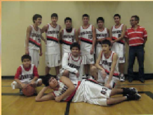
NCN YOUNG GUNS