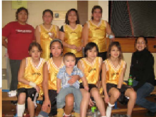
THE TFN QUEENS