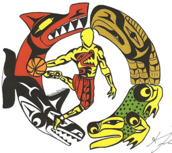
"Keeping the Dream Alive"

They were knocked in a close game against a team from Port Simpson, Laxkw'ALaams ending with a score of 76-69.